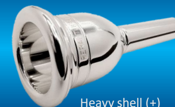
Heavy shell (+)