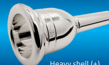
Heavy shell (+)