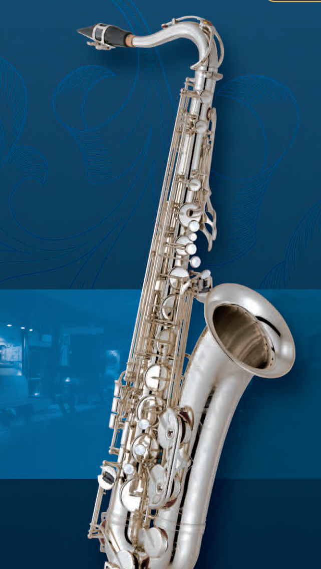
B<sup>1</sup> Tenor Saxophone YTS-82ZS

Finish: Silver-plated Auxiliary Keys: Front F, High F‡ key Neck: Custom TV1S Case: TSC-820